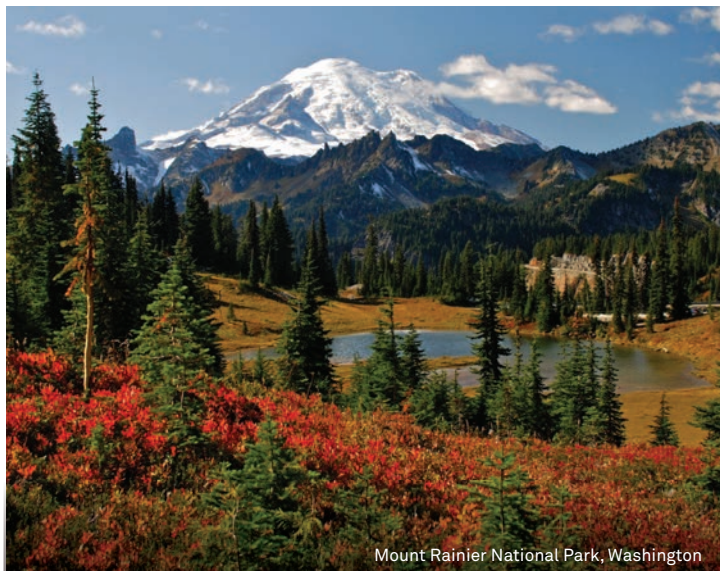
Mount Rainier National Park, Washington