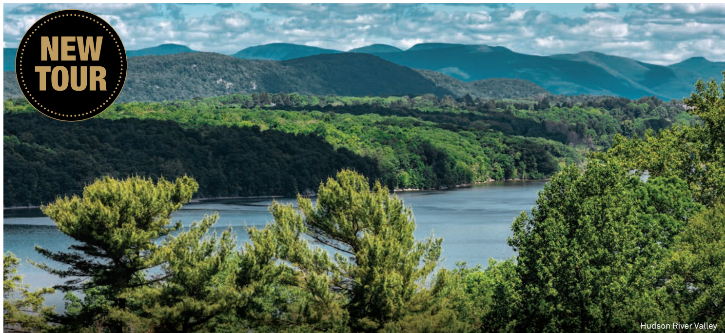
Hudson River Valley