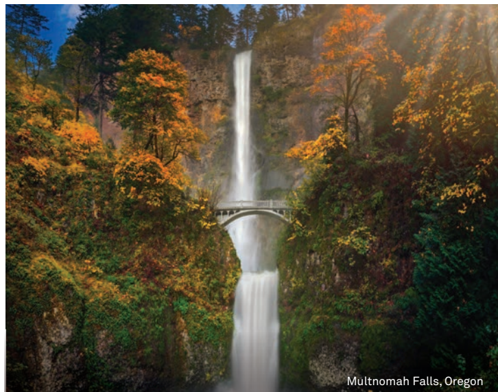
Multnomah Falls, Oregon