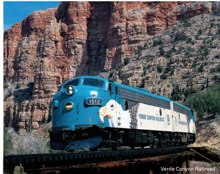
Verde Canyon Railroad