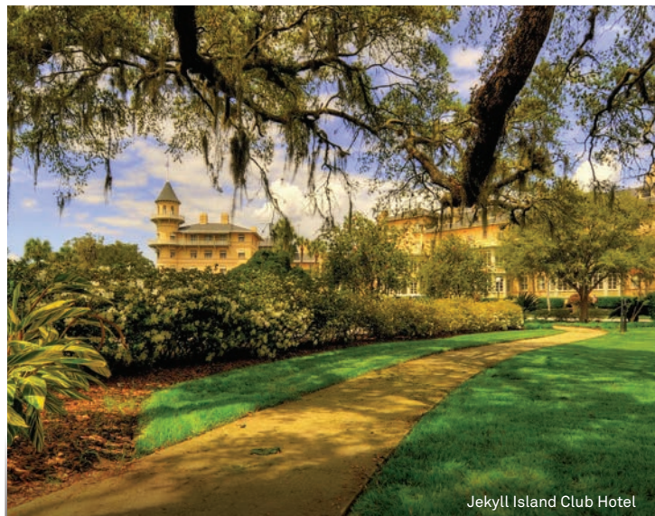
Jekyll Island Club Hotel