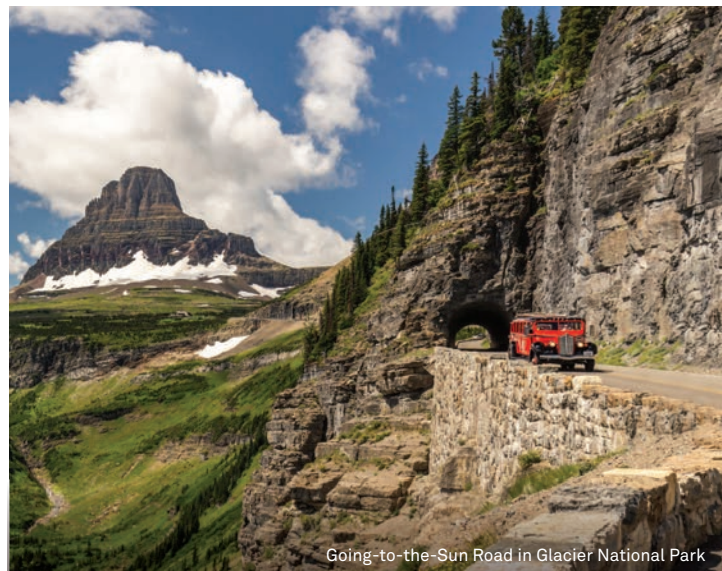
Going-to-the-Sun Road in Glacier National Park