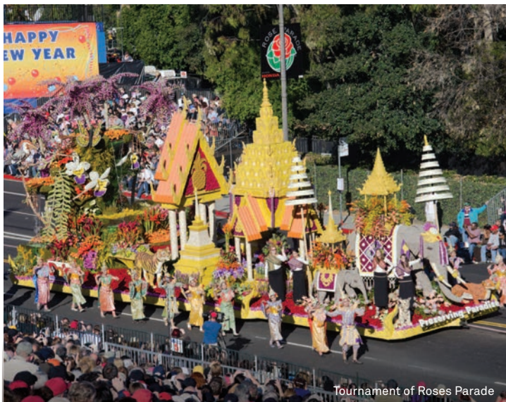
Tournament of Roses Parade