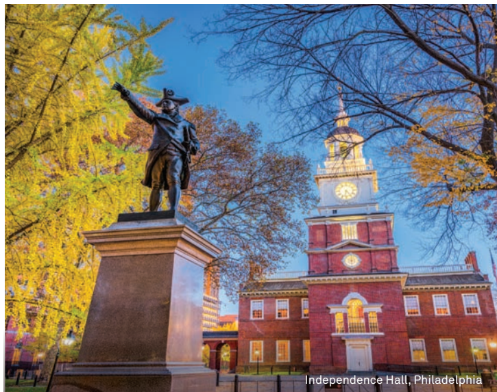
Independence Hall, Philadelphia