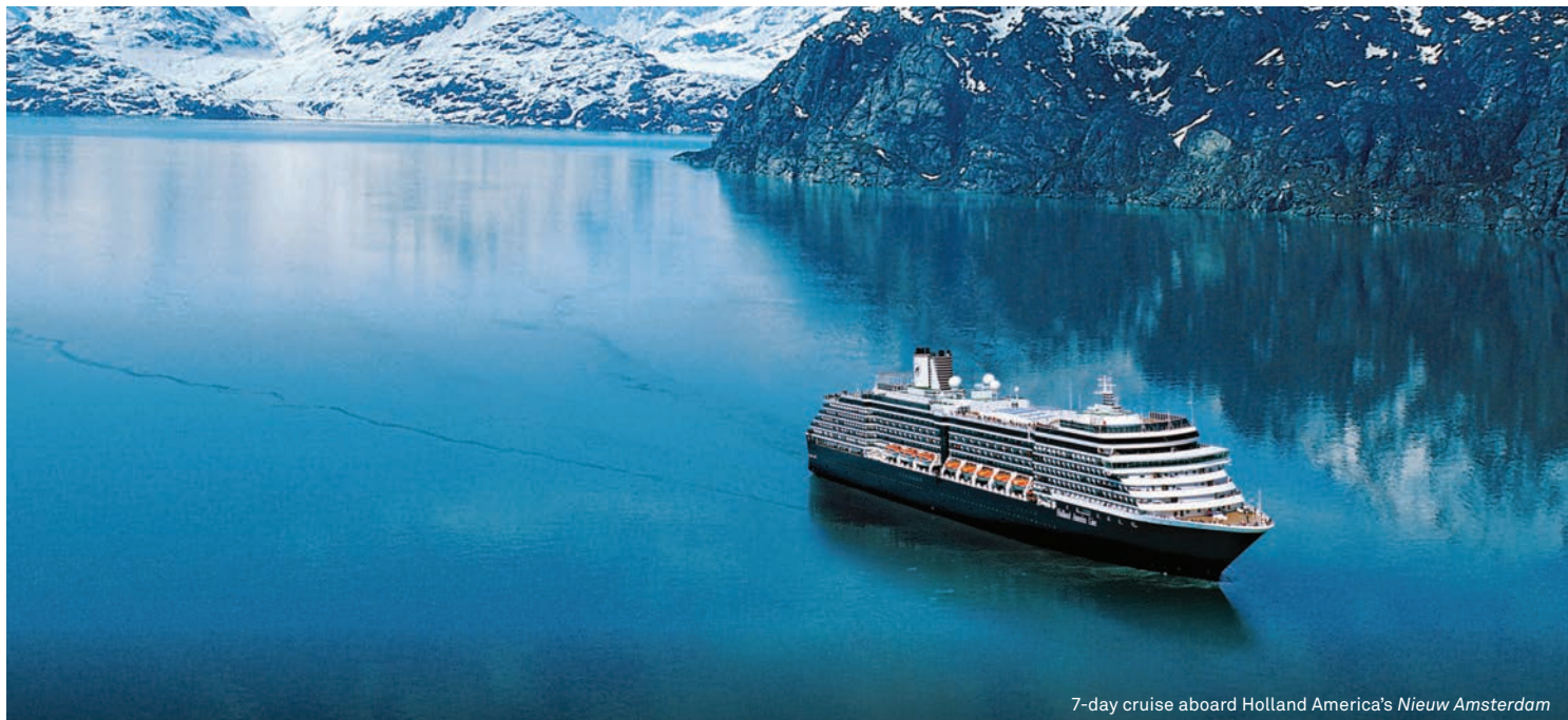
7-day cruise aboard Holland America's Nieuw Amsterdam