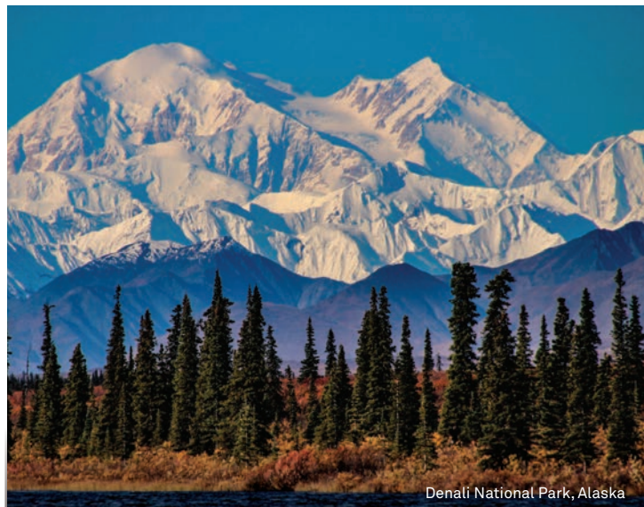
Denali National Park, Alaska