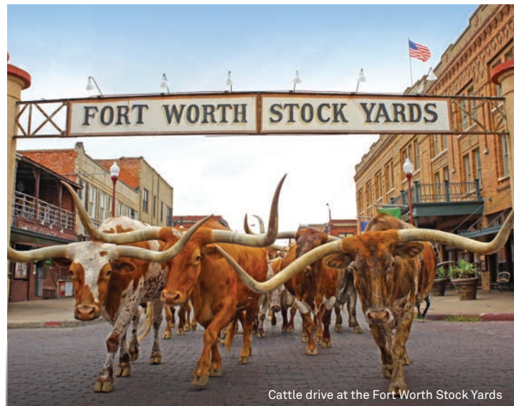
Cattle drive at the Fort Worth Stock Yards