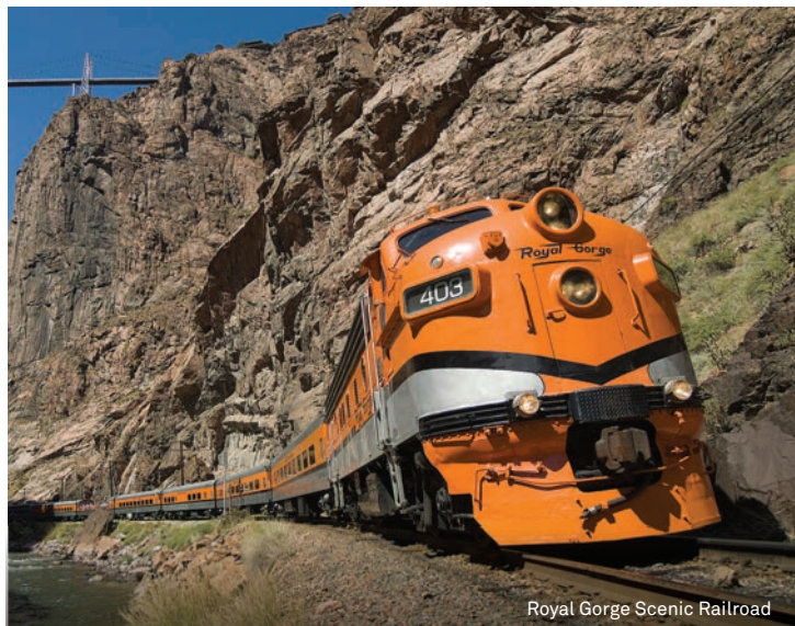
Royal Gorge Scenic Railroad