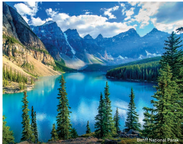
Banff National Park