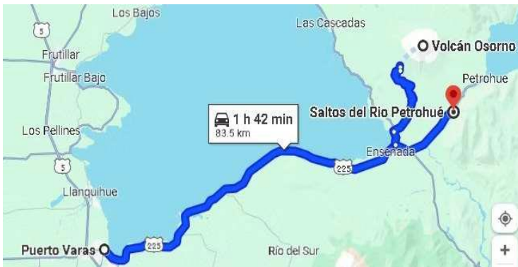
Drive from Puerto Varas to Osorno Volcano

We will explore the beautiful city of Puerto Varas, also known as "The City of Roses." A stop along the waterfront will allow us to appreciate the view of the city with Lake Llanquihue in the background. We will also visit the Old German Settlers' District, then continue through the city center, following the lakeshore. If the weather allows, we will enjoy views of the majestic Osorno Volcano.