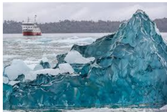
SAN RAFAEL GLACIER

Carlson Maritime Travel 623 E. Tarpon Ave Tarpon Springs, Fl. 34689 727.945.1930 info@scarlsonsvl.com