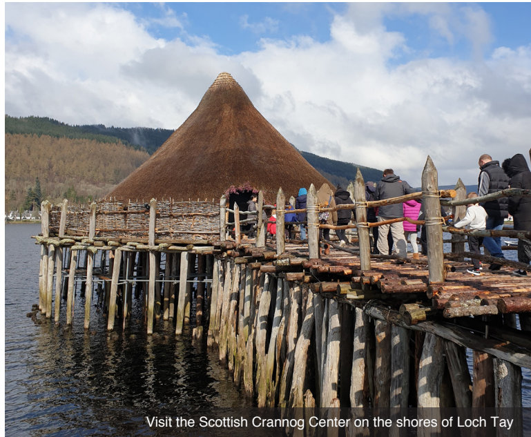
Visit the Scottish Crannog Center on the shores of Loch Tay

DAY 1 Depart the USA: Depart your gateway city on an overnight flight to Glasgow, Scotland.