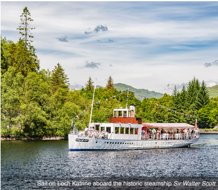
Sail on Loch Katrine aboard the historic steamship Sir Walter Scott