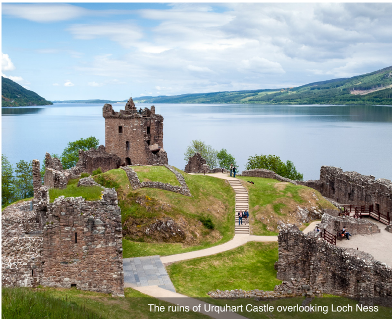
The ruins of Urquhart Castle overlooking Loch Ness

with dramatic scenery and striking architecture. During the panoramic city tour, see the historic Old Town and the elegant Georgian New Town, both UNESCO World Heritage Sites. Visit the city's icon, Edinburgh Castle, perched high atop a hill, offering panoramic views of stately mountains, rolling hills and lovely countryside. Inside the castle, stand in awe of the Scottish Crown Jewels, featuring the crown, sword, and scepter, which are among the oldest regalia in Europe. After free time for lunch on your own, depart for Roslin, a tiny village outside Edinburgh, where you visit Rosslyn Chapel. This 15th-century church is famous for its decorative art and mysterious associations with the Knights Templar and the Holy Grail. This evening, dinner is included. Meals: B, D