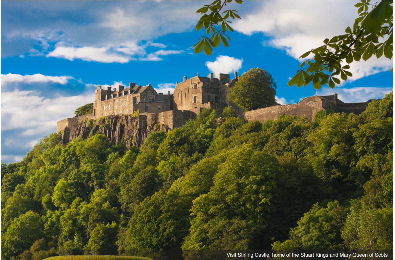
Visit Stirling Castle, home of the Stuart Kings and Mary Queen of Scots