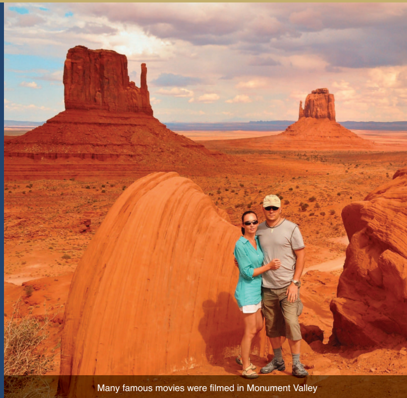
Many famous movies were filmed in Monument Valley

Day One – Golden Nugget Hotel & Casino, Las Vegas, Nevada Days Two and Three – Grand Canyon Lodges, Grand Canyon, Arizona Day Four – Lake Powell Resort, Page, Arizona Day Five – Desert Rose Inn, Bluff, Utah Day Six – Capitol Reef Resort, Torrey, Utah Days Seven and Eight – Holiday Inn Express, Springdale, Utah