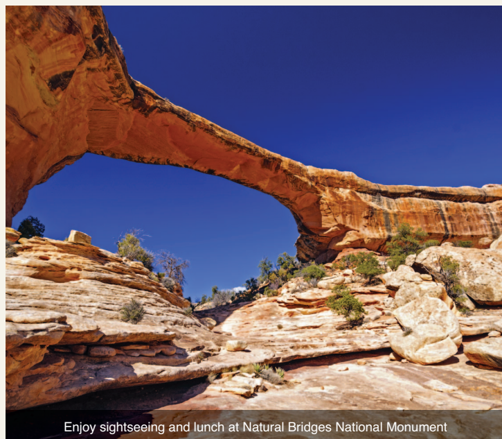
Enjoy sightseeing and lunch at Natural Bridges National Monument

This morning, leave Utah and travel through the Virgin River Gorge en route to Las Vegas McCarran International Airport for flights home departing after 1:00 p.m. Meal: B