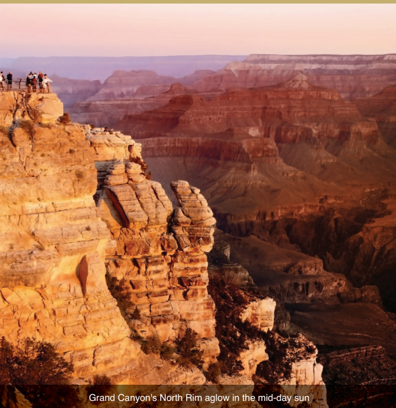
Grand Canyon's North Rim aglow in the mid-day sun