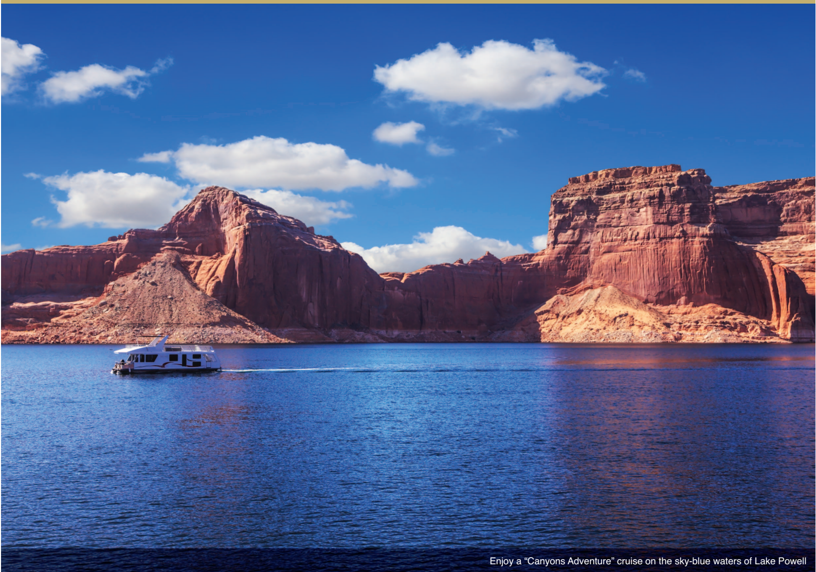
Enjoy a "Canyons Adventure" cruise on the sky-blue waters of Lake Powell