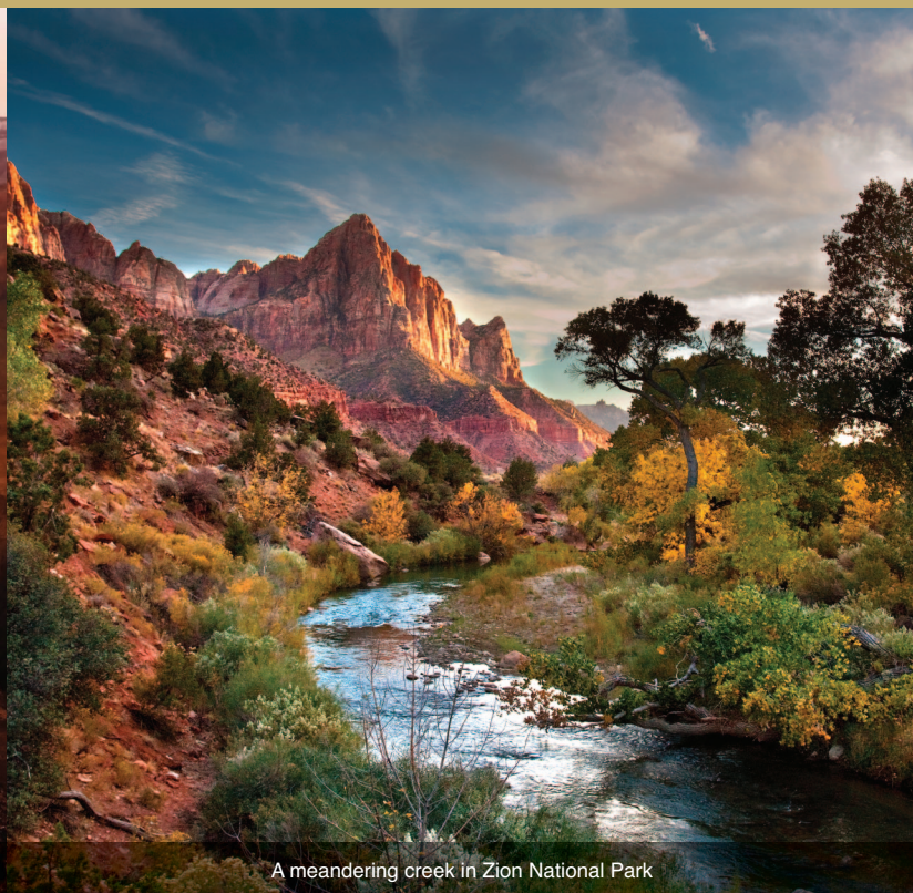
A meandering creek in Zion National Park